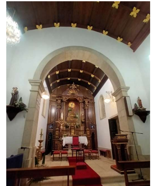
High altar of the Sanctuary

The sanctuary's interior is a true masterpiece. The high altar was carved in chestnut wood by master artisans from Oporto. It features large Corinthian-inspired columns framing the throne that holds the statue of Our Lady of Health, a 20th-century polychrome clay sculpture. The original statue, dating from the 18th century, is kept in the Abbot's House.