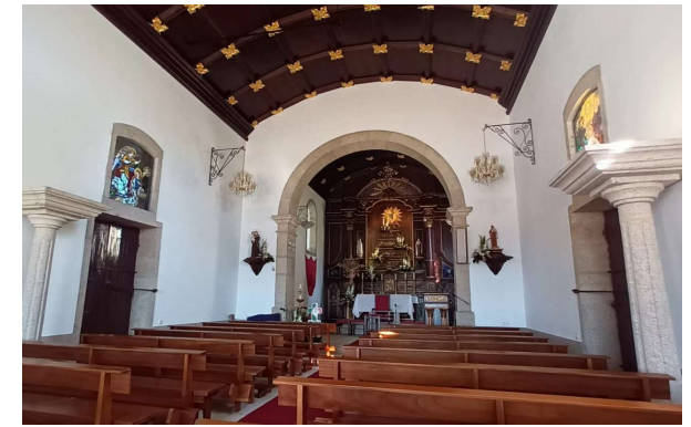
Interior of the Temple