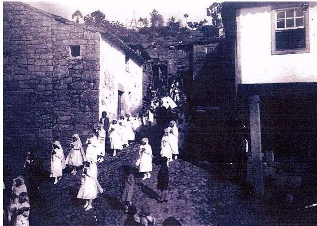
Procession in the Late 1920s, descending Rua da Calçada, with the construction of the Chapel of Our Lady of Health in the background (Unknown author)