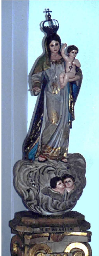
Original image of Our Lady of Health in Longa

For decades, the military kept the devotion alive, financing the ceremonies through mandatory contributions from their wages.